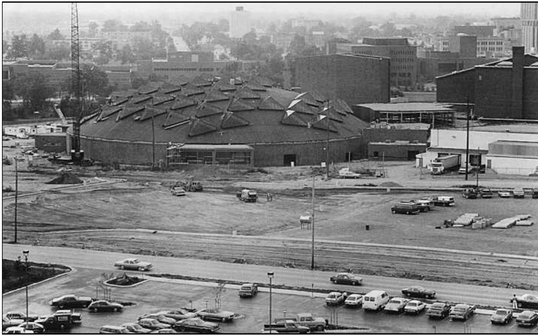
FLINT'S AUTOWORLD is shown under construction on Aug. 15, 1983. The prominent, 300-foot-diameter geodesic dome housed a huge array of attractions – so much of an assortment that it wasn't clear if Autoworld was a museum or a theme park. Weak attendance led investors to cut their losses and they initially closed the site less than a year after it opened.

Oh, AutoWorld. To wishful thinkers, you seemed like a good idea when you opened in Flint in 1984. Conceptually, maybe you temporarily filled a void in Michigan, which continues to lack a central place where visitors and tourists can go to appreciate, celebrate and understand the impact of the automotive industry on the world. (The Henry Ford in Dearborn features much more than vehicles). But realists, like former GM Chairman Roger Smith, futilely asked as plans for AutoWorld were being finalized, "What can I do to stop it?" In the end, Flint's short-lived Six Flags AutoWorld tried and failed, miserably – and offers a few lessons of how not to attract tourists or to celebrate the automobile.