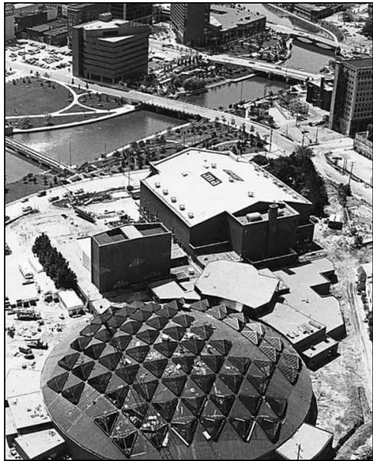
LOCATED NEAR the Flint River, the ill-fated AutoWorld is shown in 1983 under construction. In addition to the new dome, Autoworld incorporated the Industrial Mutual Association Auditorium (1929) nearer the river. The auditorium was established by auto manufacturers in the Flint area, offering workers recreational and educational activity space. It was demolished along with the rest of the AutoWorld site in 1997.

"Over a decade of development by a parade of consultants who pushed the city almost exclusively towards a theme park morphed the humble dream of a science museum into something unrecognizable," wrote Erin Marquis in a 2022 article