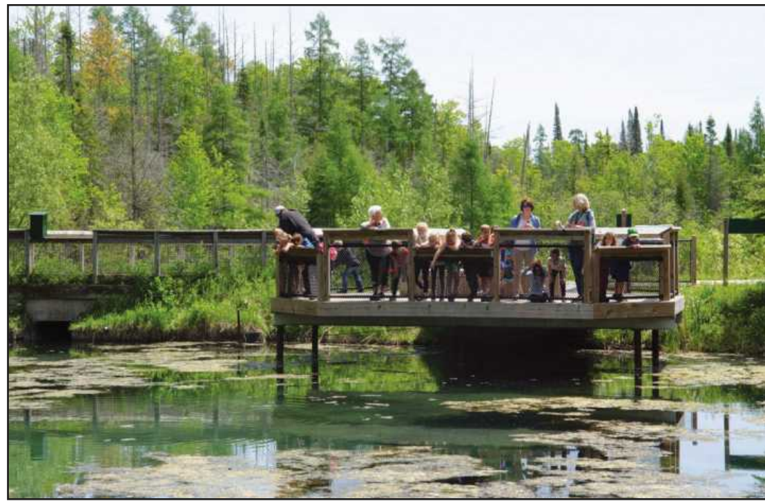
CHILDREN ENJOY a school outing on an observation deck at Oden State Fish Hatchery and Visitor Center in Alanson. The facility is due for $2.6 million in upgrades.