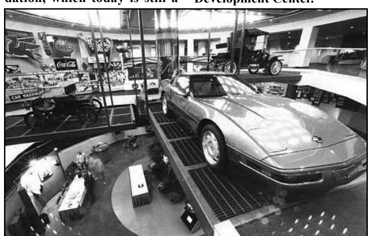
INSIDE THE AUTOWORLD Dome, there were cars on display, yes, but all manner of non-auto-related attractions, too. AutoWorld expected to attract 900,000 visitors per year (at $8.98 a head) from Michigan and surrounding states, but those expectations proved way too rosy.

The Charles H. Mott Foundation, which today is still a