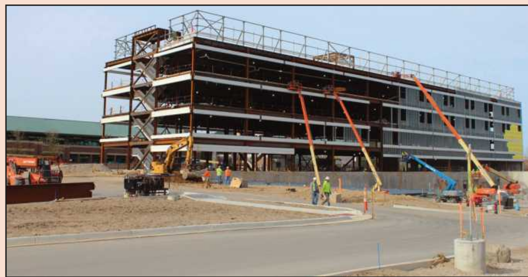
ON A FORMER PARKING LOT north of the existing Trinity Health-Brighton Medical Center, Granger Construction, its subcontractors and building trades union workers are erecting a connected new 174,000-square-foot hospital.