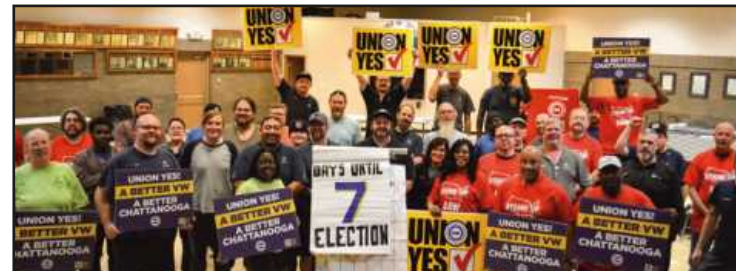
UAW SUPPORTERS gather in Chattanooga a week before the union election at VW.

“We saw the big contract that (Continued on Page 3)